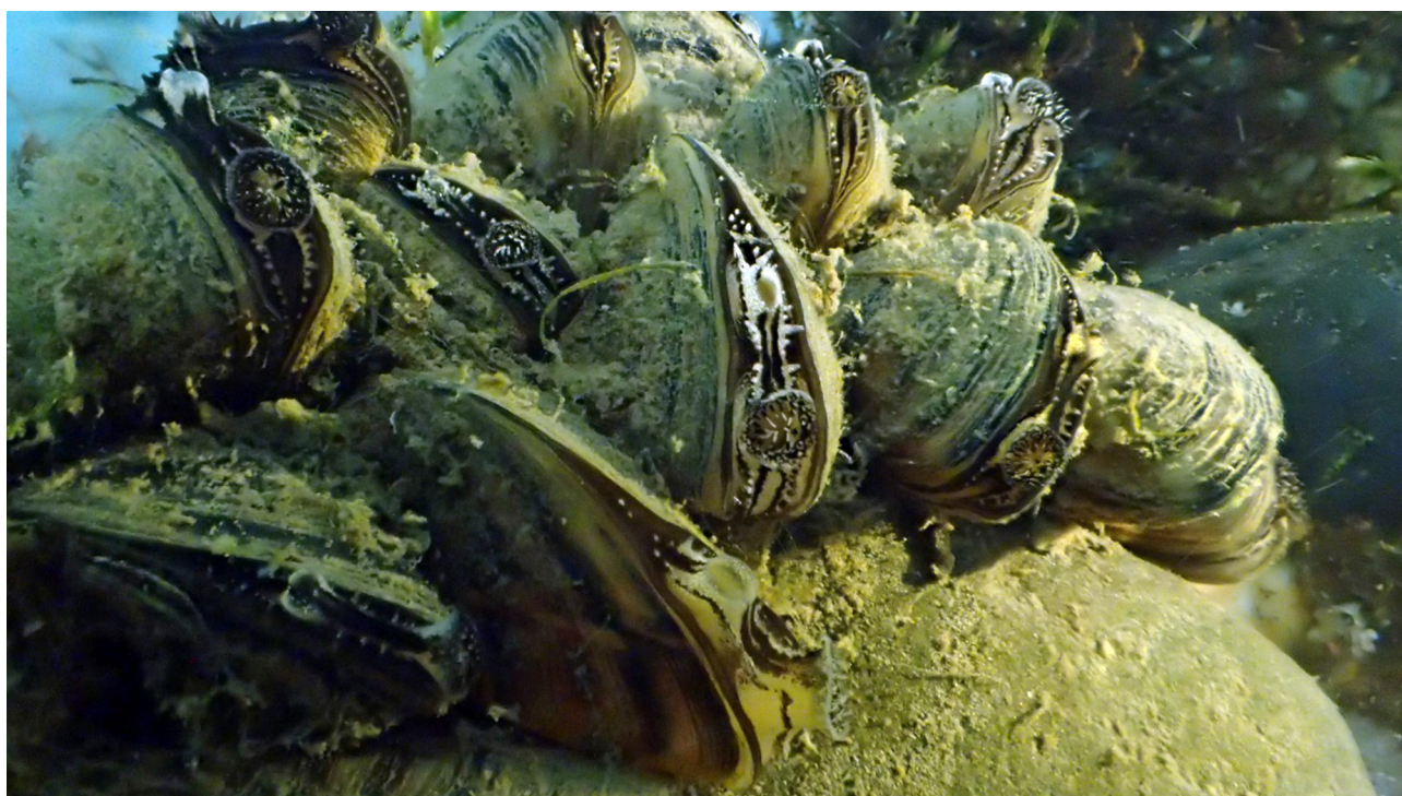
Fig. 1. The zebra mussels Dreissena polymorpha (Pallas, 1771) from the Tresna Reservoir

According to the map of D. polymorpha distribution in Poland published by PIECHOCKI & DYDUCH-FALNIEWSKA (1993), the zebra mussel is rare or absent in mountain areas, in both Carpathians and Sudetes. The southernmost known locality of this species was noted near Rożnów village in southern Poland (PIECHOCKI & DYDUCH-FALNIEWSKA 1993). The localities described in this study are thus the first of D. polymorpha from the Polish Carpathian Mts for 25 years. The presence of empty shells and alive individuals of various sizes suggests that these populations are relatively stable. Despite the evidence the