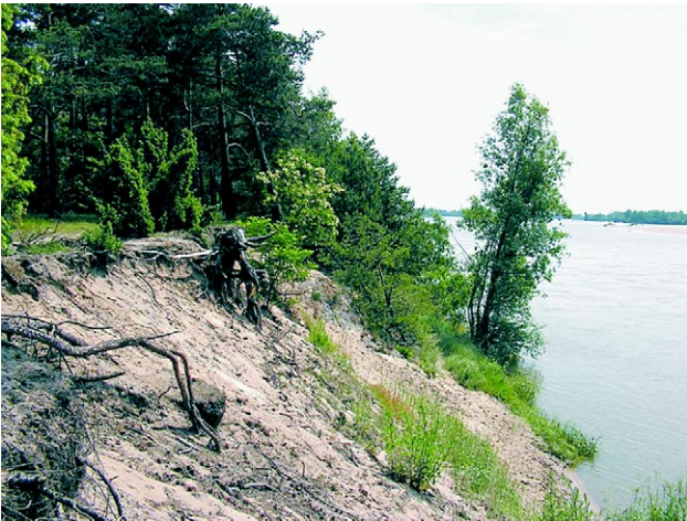
Fig. 4. A high and steep river bank

Chelidonium majus L., Rumex acetosa L., Plantago major L., Rubus fruticosus L., Sambucus nigra L., Quercus rober L., Acer plattanoides L. and Salix alba L., and is especially frequent on stems and leaves of Solidago virgaurea L. and S. canadensis L. These plants often occur on alluvial deposits.