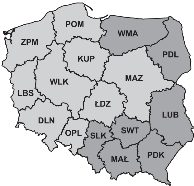
Fig. 1. Voivodeships of Poland included in the study (light grey): DLN –Dolnośląskie, KUP – Kujawsko-Pomorskie, LBS – Lubuskie, LUB – Lubelskie, ŁDZ – Łódzkie, MAŁ – Małopolskie, MAZ – Mazowieckie, OPL – Opolskie, PDK – Podkarpackie, PDL – Podlaskie, POM – Pomorskie, SLK – Śląskie, SWT – Świętokrzyskie, WLK –Wielkopolskie, WMA – Warmińsko-Mazurskie, ZPM – Zachodniopomorskie

The data were divided in three parts. Part I includes the list of published literature records of C. vindobonensis . The information is arranged according to voivodeships and chronologically within each voivodeship. Part II is the list of sites based on master's degree dissertations, arranged in the same way as in Part I. Comments given by the respective authors on their records and/or information sources are given under "Remarks" in Parts I and II. Part III is the locality list based on museum collections. Geographical coordinates are given for each locality (when only a city is mentioned, the coordinates given refer to the city centre).