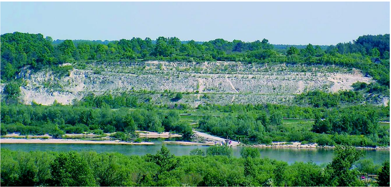
Fig. 3. A scarred and steep river bank

Vistula River, in the Saska Kępa district in Warsaw (JANKOWSKI 1933).