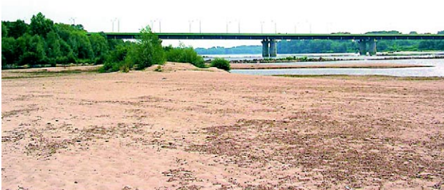
Fig. 5. An extensive flood plain