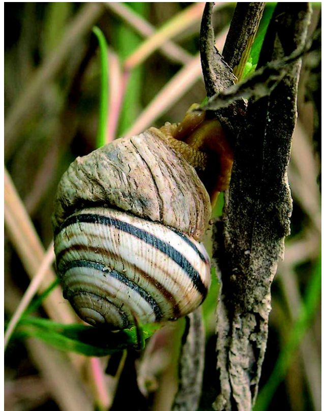
Fig. 6. Cepaea vindobonensis with deformed shell