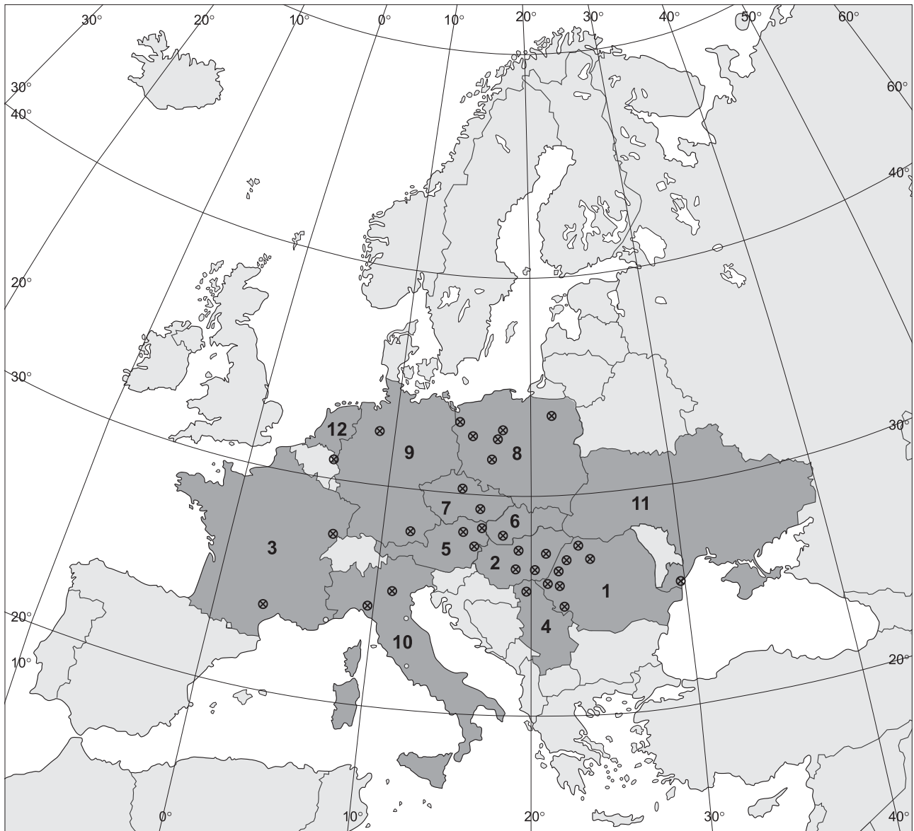
Fig. 1. Localities of Sinanodonta woodiana in Europe arranged chronologically: 1 – Romania, 2 – Hungary, 3 – France, 4 – Serbia, 5 – Austria, 6 – Slovakia, 7 – Czech Republic, 8 – Poland, 9 – Germany, 10 – Italy, 11 – Ukraine, 12 – Holland

rous fishes in the mid 1980s. The fish with the attached glochidia of Sinanodonta woodiana were released into a lake which is part of the cooling system of two electric power plants near Konin. Due to favourable environmental conditions (primarily the thermal regime of the water), the species is now very abundant in the lake, canals, initial cooling basin, and the cultivation ponds of this system (AFANASYEV et al. 2001, KRASZEWSKI & ZDANOWSKI 2001, in press, KRASZEWSKI 2006). For nearly twenty years, this remained the only site in Poland at which the occurrence of Sinanodonta woodiana was documented. However, it is suspected that in the 1980s the species invaded also natural water bodies. The shells of this mussel were noted by BÖHME (1998) in the Narew River not far from the village of Topilec. The occurrence the Chinese mussel was next noted in fish ponds in the