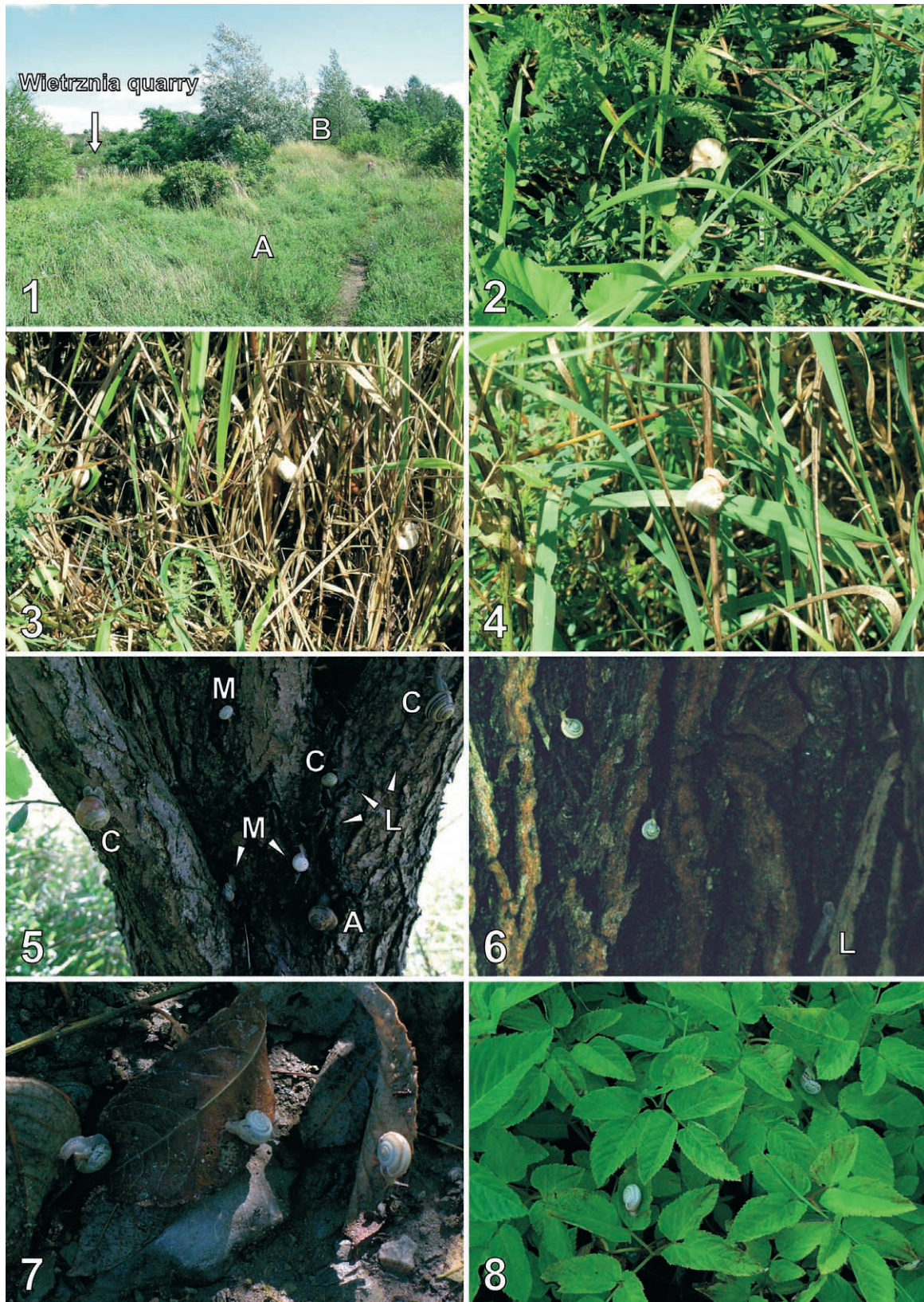
Fig. 2. Monacha cartusiana in its habitat at the newly discovered site at Wietrznia, Kielce: 1. General view of the new site: A – grass-covered area, B – coppice; 2. M. cartusiana among herbaceous plants; 3. M. cartusiana among grass blades; 4. M. cartusiana on a blade of Arrhenatherum elatius ; 5. Snails on a trunk of Robinia pseudoacacia : M – M. cartusiana , A – Arianta arbustorum , C – Cepaea nemoralis , L – Laciniaria plicata ; 6. Juvenile M. cartusiana on a trunk of R. pseudoacacia , with an adult L. plicata (L); 7. M. cartusiana on dead leaves under the trees; 8. M. cartusiana among young specimens of Aegopodium podagraria