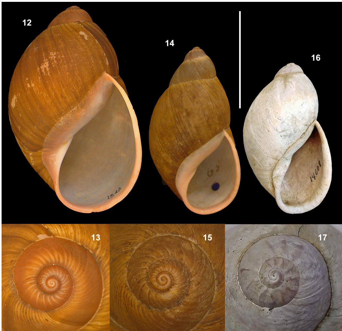
Figs 12–17. Shells of Megalobulimus spp. for comparison, with detail of protoconch: 12–13 – M. bronni , specimen MZSP 92421, from Além Paraíba (MG), ventral view (12) and protoconch detail (13); 14–15 – M. yporanganus , holotype MZSP 64144, from Iporanga (SP), ventral view (14) and protoconch detail (15); 16–17 – M. klappenbachi , holotype MZSP 29317, from Iguape (SP), ventral view (16) and protoconch detail (17). Scale bar for shells 50 mm

the shells could have been brought passively (usually post-mortem) into the cave by water, such as during flooding events (e.g., VIEIRA & SIMONE 1990). Those two options indicate, respectively, an autochthonous or parautochthonous (the shells are reasonably well preserved) origin of the snails. However, Lagoa Santa is also an archaeological setting, which brings the human factor into the fold.